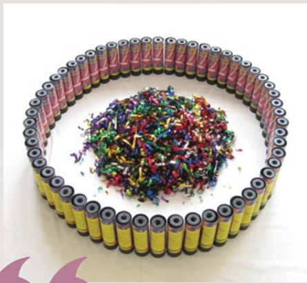
Rainbow pop Out , 2014