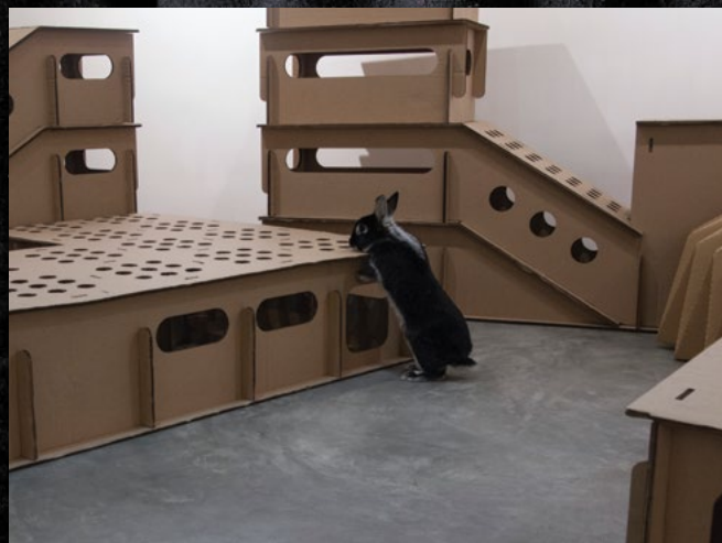
Hop art Rabbit Warren, Platform China, 2014