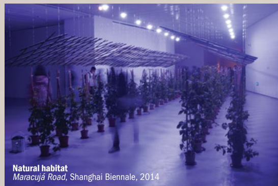
Natural habitat Maracujá Road, Shanghai Biennale, 2014